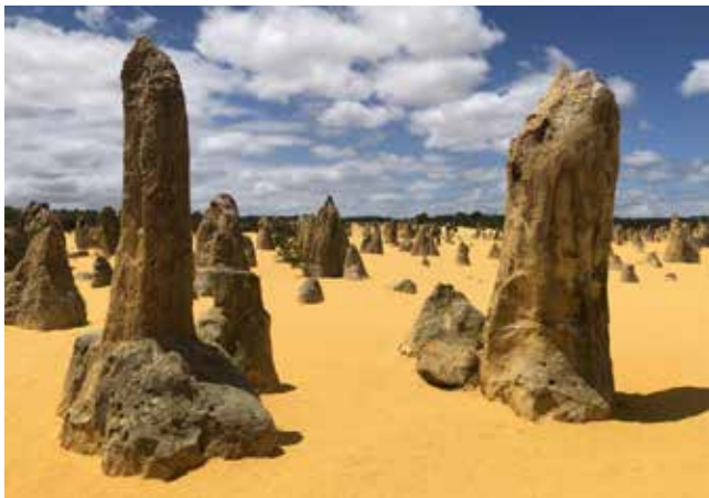
Pinnacles National Park, West Australia