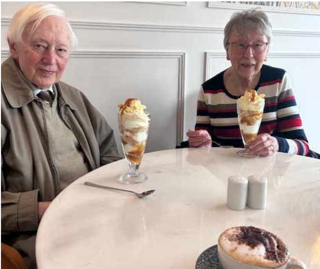
Lunch at the Pheasant Allithwaite

Our gardens are showing many signs of Spring and as we move into April let's hope we shall enjoy more sunny days.