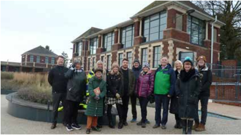
Members of Save Grange Lido and council officers and members on a site visit at Grange Lido.

According to Westmorland and Furness Council work is set to restart on the Grange Lido project, with a planned finish around the end of the summer of this year.